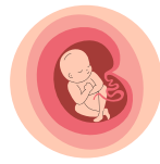
Early Pregnancy Clinic