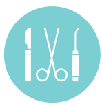
Acute Surgery Clinic

SCOPE has resulted in the creation of many facilitated clinical pathways to meet local needs: